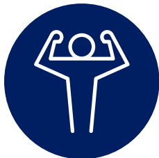
FINANCIAL HARDSHIP FOR ACADEMIC ACCESS