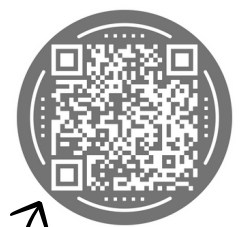
Explore Our Values

Over the last 14 years , we've gifted more than $2.5 million to fund over 126 innovative teacher projects, 77 unique academic experiences for individual students, and 12 district-wide initiatives.