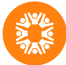
DIVERSITY, EQUITY, INCLUSION, & BELONGING